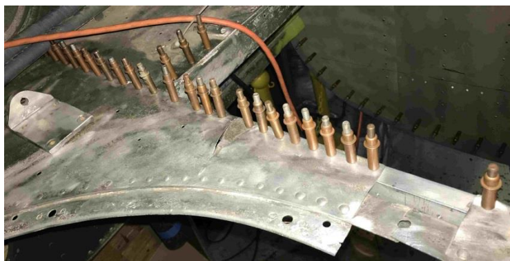
Top part of angle aluminum ready for riveting

All holes are drilled, clecos are in place and riveting has begun in the area around the lower turret. The rail for the floor in the radio operator's area is drilled on one wall. Working in this area is almost like putting a puzzle together, taking it apart, and riveting it all back together again.