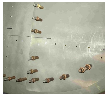
Holes ready for floor angle aluminum