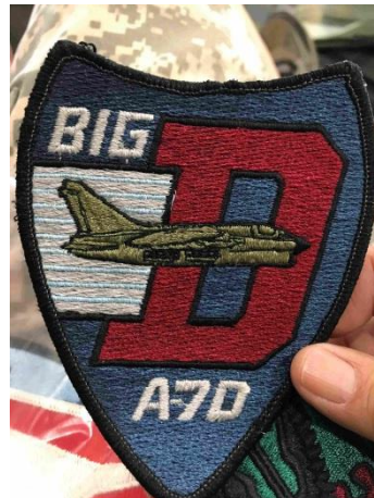
Beautiful A-7 D patch